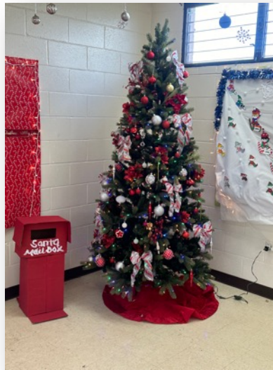
Special Christmas tree