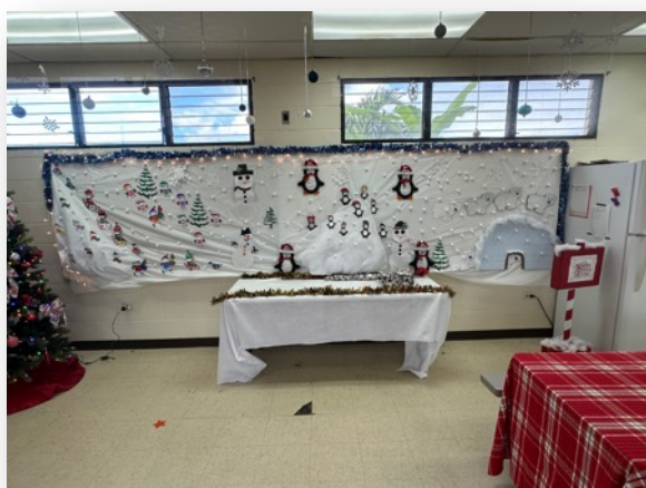
One of the man murals