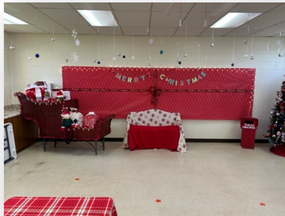
Santa's Sleigh and seat