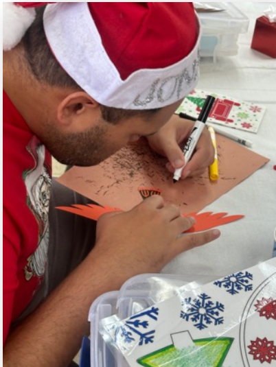
An artistic Guest