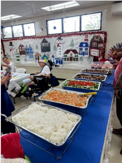
A great lunch provided by Lanakila