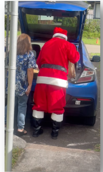
Santa unloading gifts