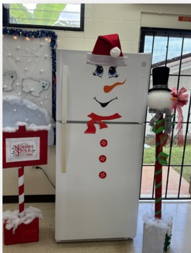
Frosty the Snowman?